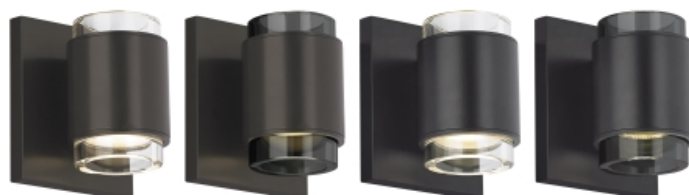
Clear Antique Bronze