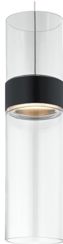
Clear / Clear Black Ring