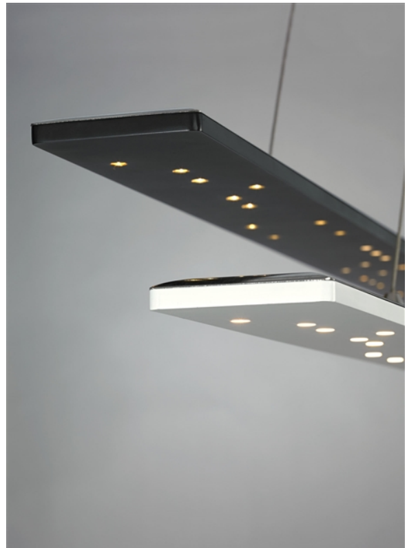
Parallax Linear Suspension

The ultra-thin aluminum and acrylic body houses 30 high-powered LEDs which contribute to its simplistic beauty but also make it incredibly functional in both residential and commercial applications. Includes 40 watt, 1889.5 total delivered lumen, 3000K LED. Both finish options ship with Satin Nickel canopy and 12 feet of field cuttable cable. Dimmable with low-voltage electronic dimmer.