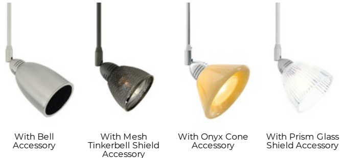
With Bell Accessory