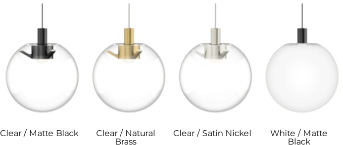
Clear / Matte Black