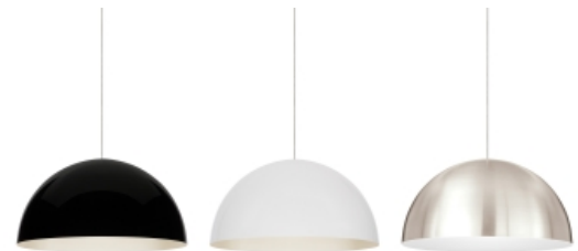
High Gloss Black / White