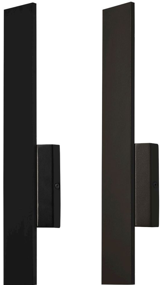
BLADE 18 OUTDOOR WALL shown in black

* Visit techlighting.com for specific warranty limitations and details.