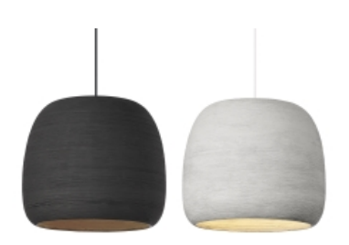
Black/Black Small Concrete / White