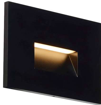
IKON OUTDOOR WALL/STEP LIGHT shown in black

* Visit techlighting.com for specific warranty limitations and details.