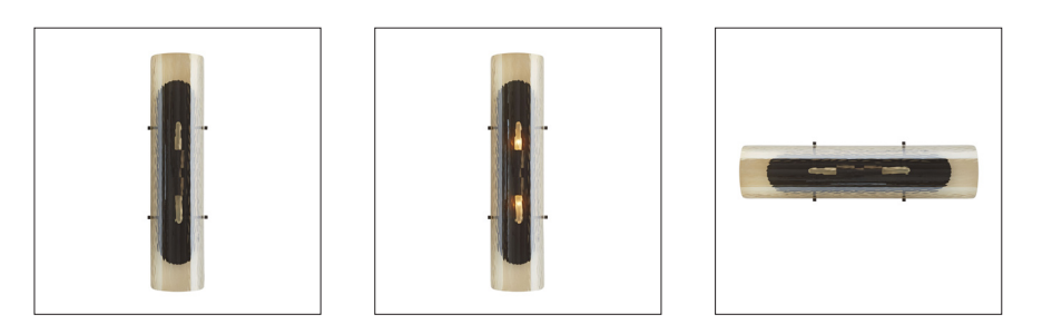
DA49016 H: 26 IN, W: 6 IN, D: 4 IN Blackened Steel, Amber Luster Glass Contract Suitable As Is

The Bend sconce casts dynamic, directional patterned light through a long, narrow half-cylinder of rippled glass. A celebration of the subtle variations of hand-blown glass, Bend's textural amber glass floating shade encases a modern, pill-shaped blackened steel plate, creating a bold interplay of materials and forms that make it an ideal choice for corridors and vanities The Bend sconce is available in silvery grey Smoke and warm Amber glass. Damp-rated, although limited covered outdoor areas may affect finish.