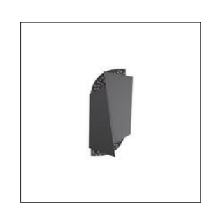
DWIII H: 18.5 IN, W: 8 IN, D: 4 IN Blackened Iron Contract Suitable As Is

Playful intersecting planes of waxed blackened iron and black chiseled marble make an eye-catching mix in this modern sconce. Making the most of its intriguing lattice surface, it is designed so that light will reflect off the chiseled marble surface, delivering a soft and moody glow to any space. Damp-rated, although limited covered outdoor conditions may affect finish. Finish will vary.