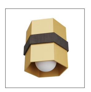
DFC10 H: 6.5 IN, W: 6 IN, D: 6 IN Antique Brass Contract Suitable As Is

A hexagonal form of iron plated in antique brass draws from the pleasing lines of classical architectural columns. For visual interest, this flush mount is encircled with a lightly textured band of English bronze finished iron to emphasize its shape. Damp-rated, although limited covered outdoor conditions may affect finish. Finish will vary.