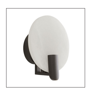
49755 H: 9 IN, W: 7.5 IN, D: 4 IN Bronze, White Onyx Contract Suitable As Is

The minimalistic aesthetic of this sconce is a design force to be reckoned with. Setting the foundational stage is a gorgeous circular slab of natural alabaster, which is elevated by a bronze steel accent that adds dimension. The alabaster works to filter the light and create a natural warm glow. We see this jewelry-inspired sconce, hung in multiples, adding a contemporary-classic vibe to a space. Damp rated, though limited outdoor conditions may affect finish. Damp-rated, although limited covered outdoor areas may affect finish.