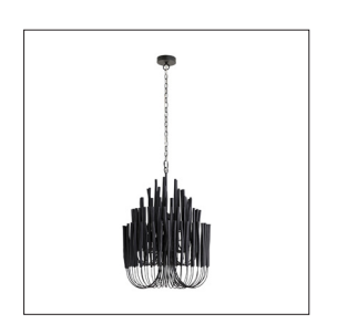
89483 H: 30 IN, Dia: 21.00 IN Black Stained Wood, Black Contract Suitable As Is

This rustically refined chandelier instantly transforms a space. The multitiered form features wooden dowels, finished in black, on curved and pliable iron arms. The wooden rods will arrive with a series of inherent fissures and cracks that will widen and multiply over time. This is considered a natural occurrence and is both beautiful and intentional. During installation, please ensure the bulbs are not in contact with the wooden components by gently adjusting the arms to create a one-inch minimum distance between the dowels and bulbs. Each piece will vary in size, shape, and finish. Additional chain available (CHN-242).