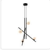
CH89832-BK/GO Black/Glossy Opal Glass