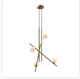
CH89832-BG/GO Brushed Gold/Glossy Opal Glass