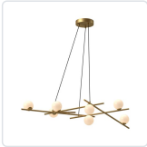
CH89854-BG/GO Brushed Gold/Glossy Opal Glass