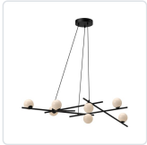
CH89854-BK/GO Black/Glossy Opal Glass