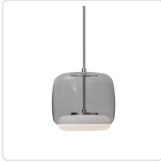
PD70610-SM/BN Smoked/Brushed Nickel