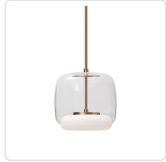
PD70610-CL/VB Clear/Vintage Brass