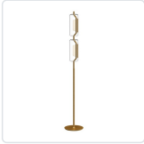
FL28563-BG Brushed Gold