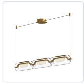
LP28543-BG Brushed Gold