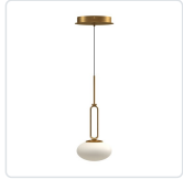
PD29806-BG Brushed Gold