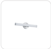
WS18-044A-BN Brushed Nickel