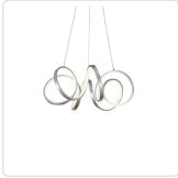
CH93824-AS Antique Silver