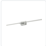
WS25336-BN Brushed Nickel