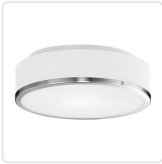
FM6012-BN Brushed Nickel