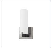
601484BN-LED Brushed Nickel