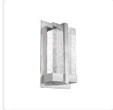
WS2812-BN Brushed Nickel