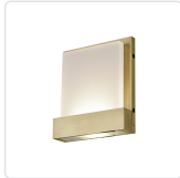
WS33407-BB Brushed Brass