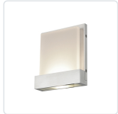
WS33407-BN Brushed Nickel

Implementing an edge-lit LED optical assembly results in a singular plane of diffusive glowing luminance. The GUIDE interior wall lamp obscures the radiant source within a precision-machined aluminum body. Slightly offset from the wall the orthogonal reductive fixture provides an optimal architectural accent. Custom patterns or text may replace the uniform translucence of the light guide.