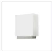
WS3909-BN Brushed Nickel