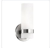
WS9809-BN Brushed Nickel

A sleek cylinder 9 inches long conceals the LED light source allowing for an even light distribution, like a scroll of paper that glows with mystery inside. There are no hotspots in this wall sconce, only an ambient glow. The opal glass is attached by a ring of brushed nickel, chrome, or vintage brass scroll and affixed to the wall by a matching circular metal disk.