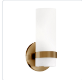
WS9809-VB Vintage Brass