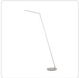
FL25558-BN Brushed Nickel