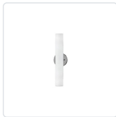
WS8318-BN Brushed Nickel