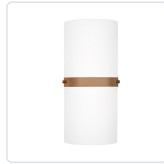
WS3413-VB Vintage Brass