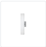
WS8418-BN Brushed Nickel