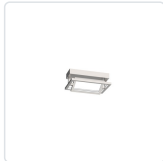
SF16212-BN Brushed Nickel