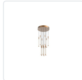
MP75113-BG Brushed Gold