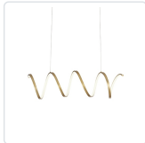
LP93742-AN Antique Brass