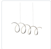
LP93742-AS Antique Silver

A looping radiant line casts light across space in a continuous helical path. The Synergy series is characterized by the rolled rectangular extrusion, which emits soft light through the silicon opal lens. Configured in both linear and ring arrangements, the arcing aluminum allows the curated finishes to be visible at every angle.