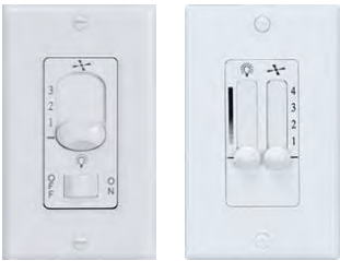
AC Control (FCT88801WT)