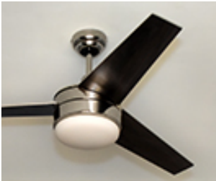
AC Control (FCT8881WT)

A contemporary, yet transitional look at economical pricing, the Trio fan is finished in Satin Nickel with 3 straight fan blades in Black on one side and silver on the other side. The fan is powered by a wall control included as well as LED JA8 compliant bulbs also included. Also available with pull chain.