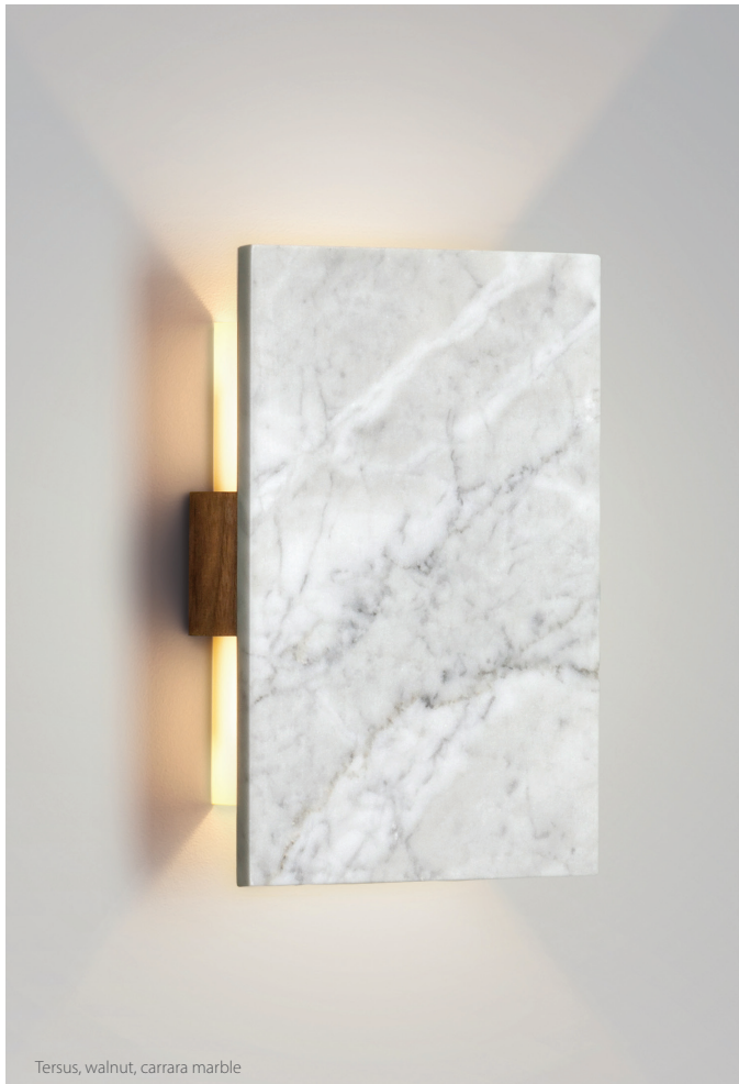
Tersus, walnut, carrara marble