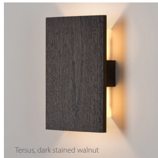
Tersus, dark stained walnut

The Tersus is an example of the simplest form unlocking a myriad of design possibilities. The long reaching light pattern cast on the wall coupled with the numerous finishes and materials offered makes the Tersus well versed for all kinds of compositions and applications.