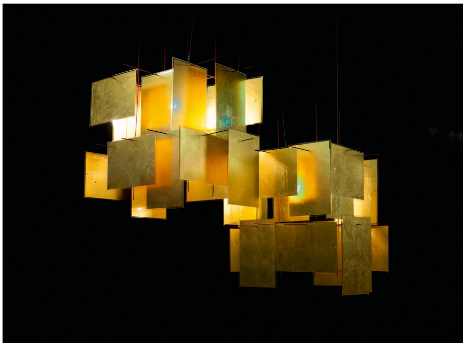
1000 Karat Blau AXEL SCHMID 2009/2016

1000 Karat Blau is a large, impressive pendant luminaire with the effect of a light object. The gold leaf in the acrylic shades reflects the warm, long-wave portion of the light back and forth, creating a particularly cozy atmosphere. As with the smaller 24 Karat Blue, which has been part of the Ingo Maurer collection since 2005, only the short-wave blue light can shine through between the molecules of the gold leaf. This makes the point of light appear bluish. Large clusters can be created by connecting several pieces together.