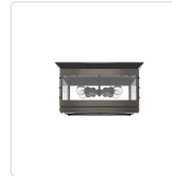
FM351004UB Urban Bronze