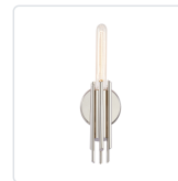
WV335409PN Polished Nickel