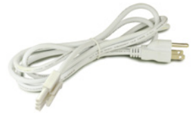
72" Cord & Plug

NUA-804B Black NUA-804W White Used to hardwire NUD-88 fixtures to NUA-802 or junction box (by others). Finish: Black or White