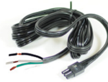
72" 3-Wire Grounded Hardwire Connector

NUA-803 Used to join two NUD-88 fixtures seamlessly together. 3-wire grounded connector. Finish: White