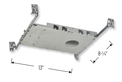
NHIOFK-1 New Construction Frame-In for 1" Remodel Housing