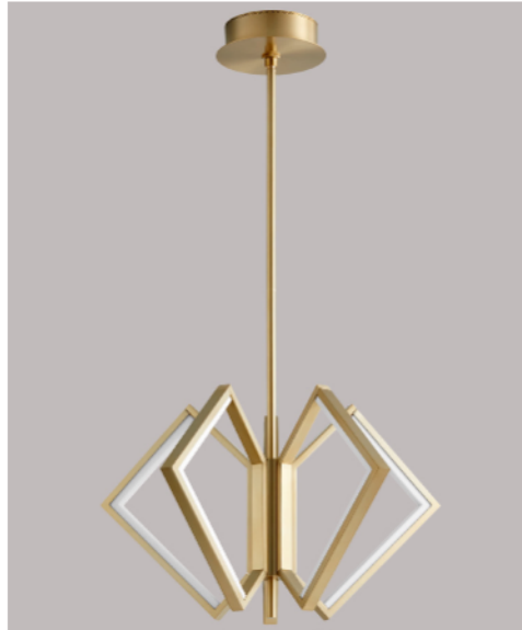
-40 Aged Brass