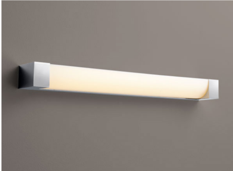
-20 Polished Nickel