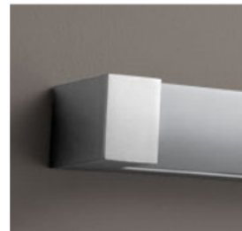
-24 Satin Nickel