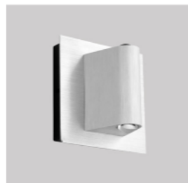
-16 Brushed Aluminum