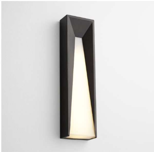
-22 Oiled Bronze