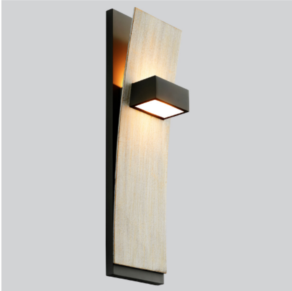
-1541 Black/Weathered Oak