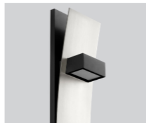
-1524 Black/Satin Nickel