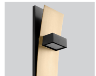
-1540 Black/Aged Brass