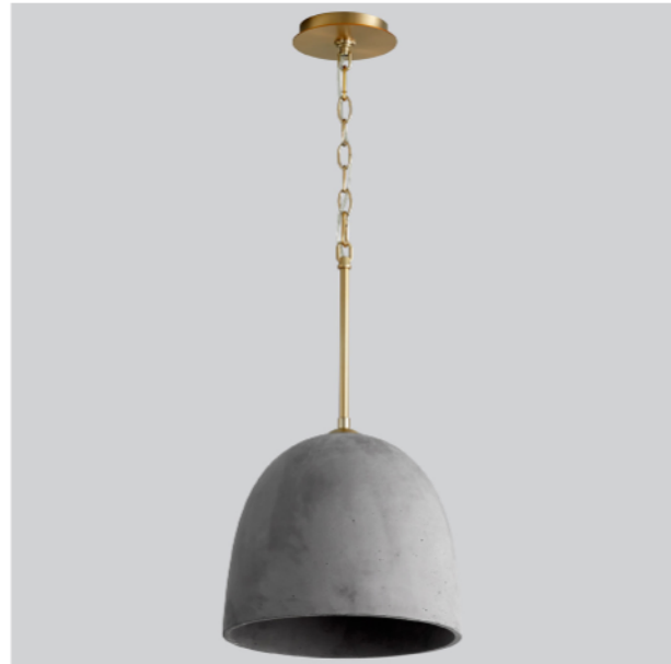
-1540 Dark Gray/Aged Brass