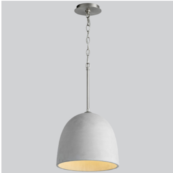
-1624 Gray/Satin Nickel Lit