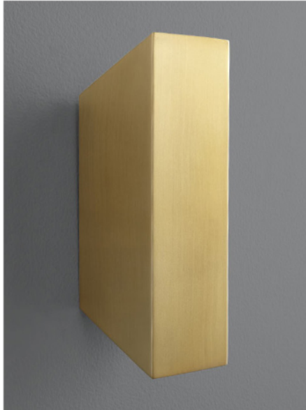
-40 Aged Brass