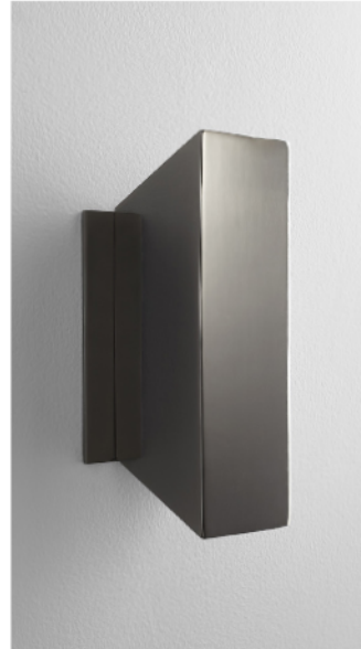
With optional backplate